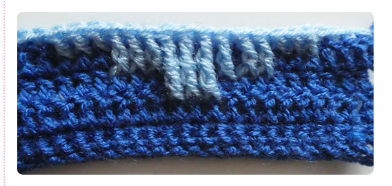
Row 8: Ch1, turn, then sc in same stitch and in next three stitches. *Sc in next fifteen stitches of both row six and row seven , then sc in next four stitches**. Repeat from * to ** three times. (80 sc)

Repeat from * to ** three times. (20 sc, 24 fptc, 24 fpdc, 12 fpdtr. 80 stitches in total)