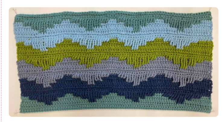
Completed block in Colorway 3