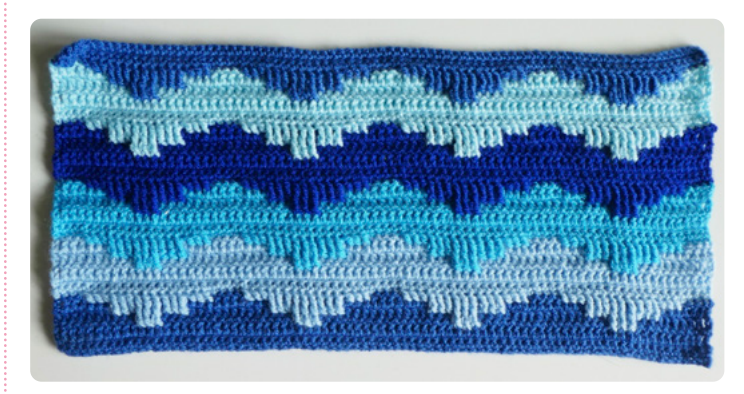
Completed block in Colorway 2